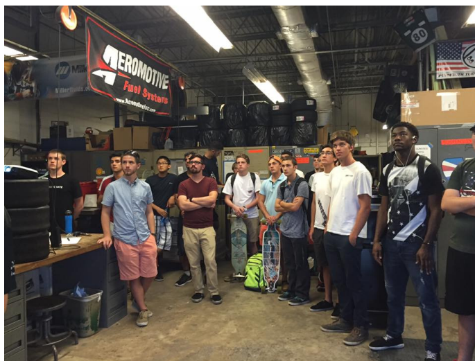
One of our New Member Meetings in the USF Racing Shop, Looking up at our projection screen

If you didn't attend the new member meetings, don't worry! There is still a large amount of time ahead of us for design and manufacturing. This means, there is still time to begin working on a project that you can put on your resume!