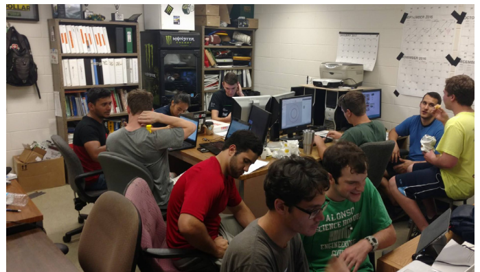
Flood of New Members at the USF Racing Shop

If you want a project, don't quit bugging our design leads! If you're brave, create your own project! Just run it by our president/team captain to see if it aligns with our design goals and determine your project's deadlines.