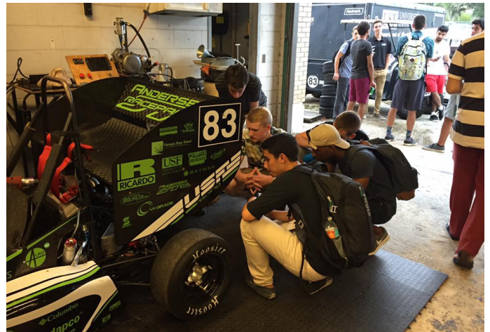
New Members getting acquainted with our powertrain system